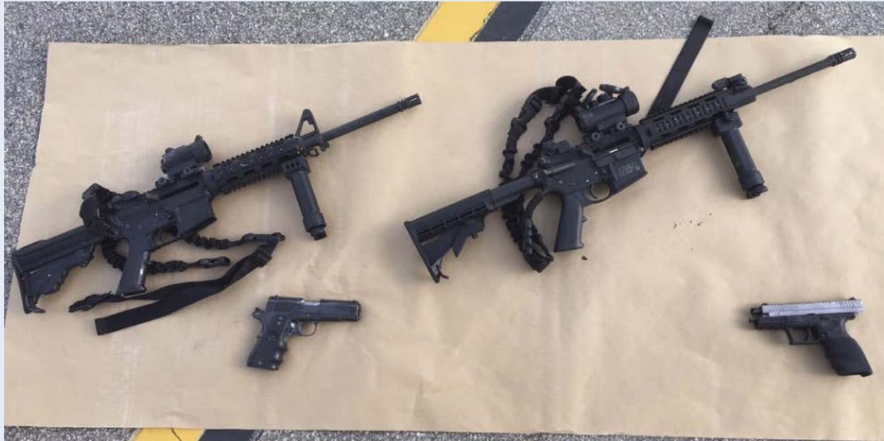
The AR-15 rifles (top) and handguns (bottom) used in the attack

The Colt ArmaLite Rifle 15, more widely known as the AR-15, is the civilian version of the Military's M-16 rifle originally designed by ArmaLite. This rifle is semiautomatic (one shot for each pull of the trigger) and uses a detachable box magazine to hold multiple cartridges. It was originally designed for the 5.56x45mm NATO cartridge; however, the AR-15 is now available in many different calibers and produced by many different manufacturers.