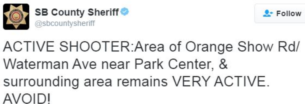
Figure 3. Tweet from SB County Sheriff’s Office