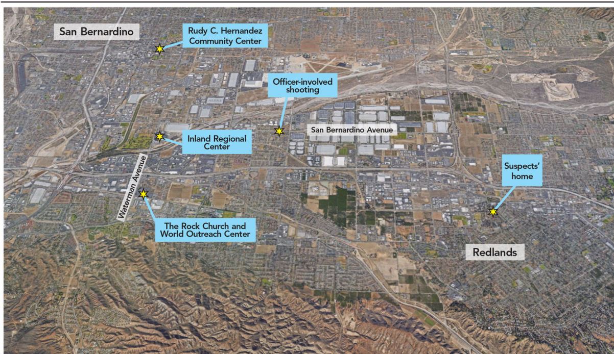
Figure 5. Relative locations of events and staging areas