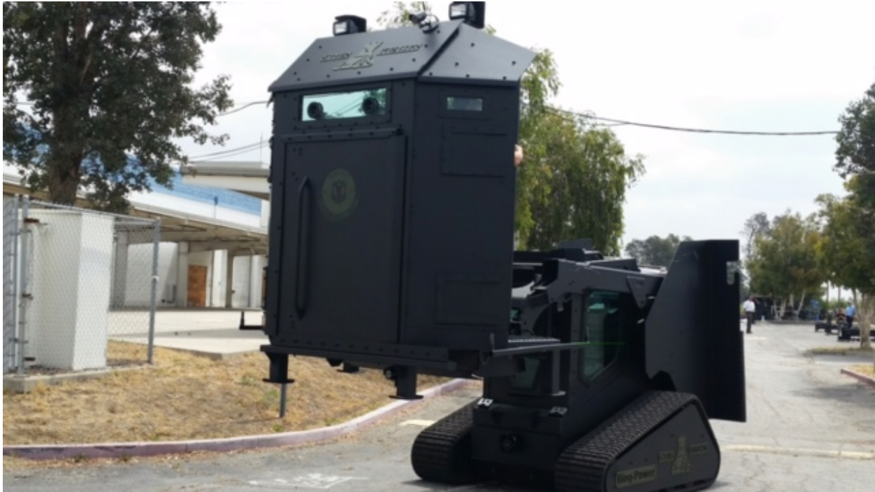
A Rook armored vehicle