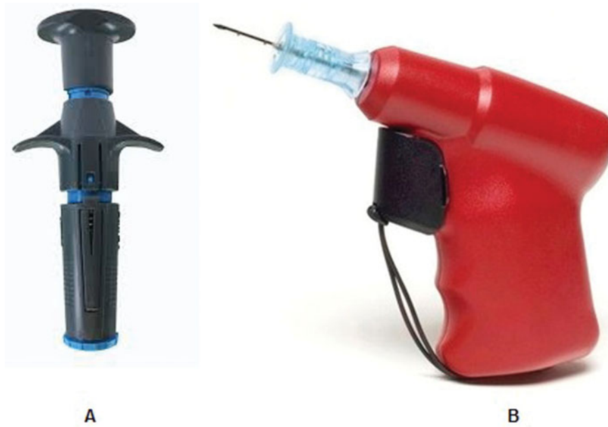
FIGURE 2. The NIO® (2A) and EZ-IO® (2B) IO devices used in the study.