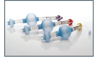
King LTS-D sizes 3, 4, 5