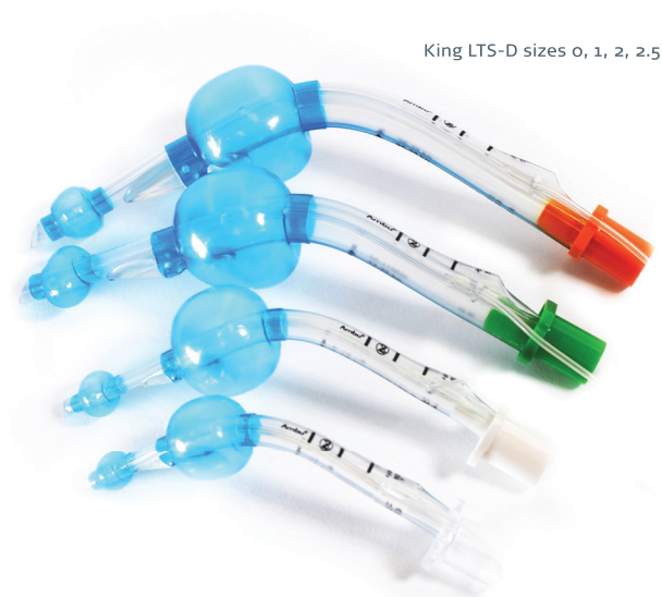
King LTS-D sizes 0, 1, 2, 2.5

Ambu USA 6230 Old Dobbin Lane Columbia, MD 21045 Tel. 800 262 8462 Fax 800 262 8673 www.ambuUSA.com