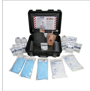
click photo to view on website