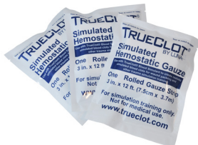
click photo to view on website