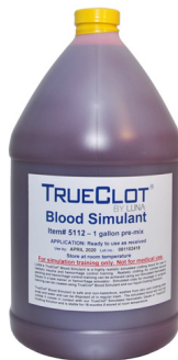
click photo to view on website