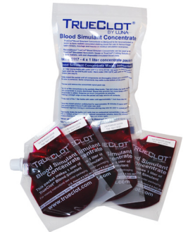
click photo to view on website