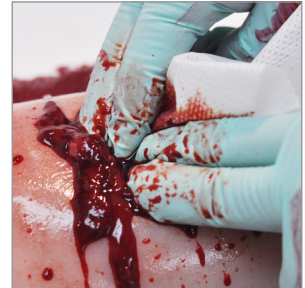
click photo to view on website