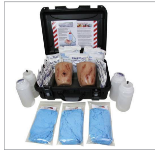
click photo to view on website