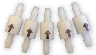
click photo to view on website