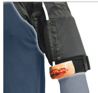
click photo to view on website